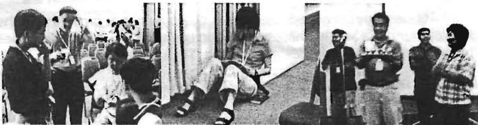
Oh! What a headache!