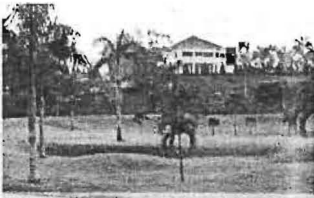
A picture of peace & tranquility